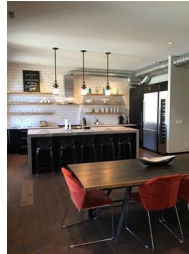
Custom Thermador Kitchen