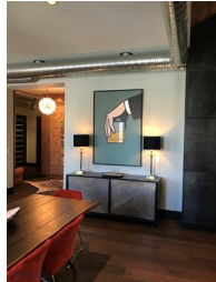
Bar Area in Greatroom