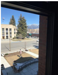
View from the Greatroom: The Bridger Mountains and the Historic Gallatin County Courthouse.