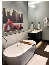
Master Bathroom with the beautiful view