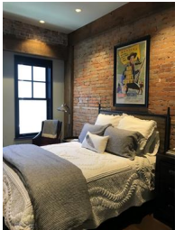
Guest Bedroom, quiet and serene