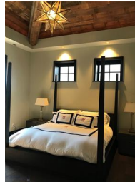
Master Bedroom with lovely light and volume