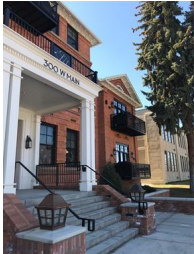
The Willson Residences, the premier downtown address!