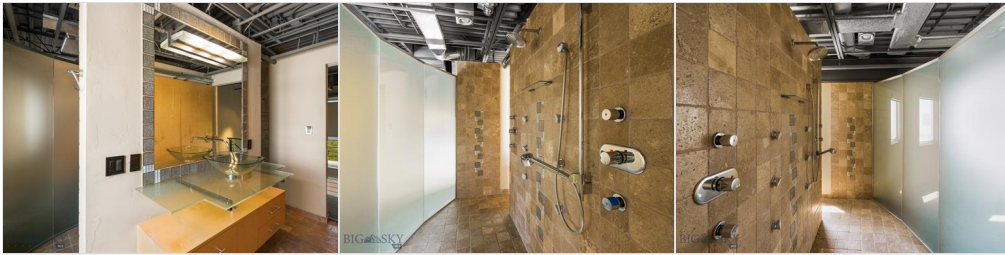
Many head shower