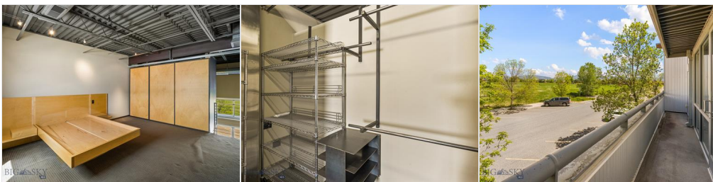
Bedroom and closet