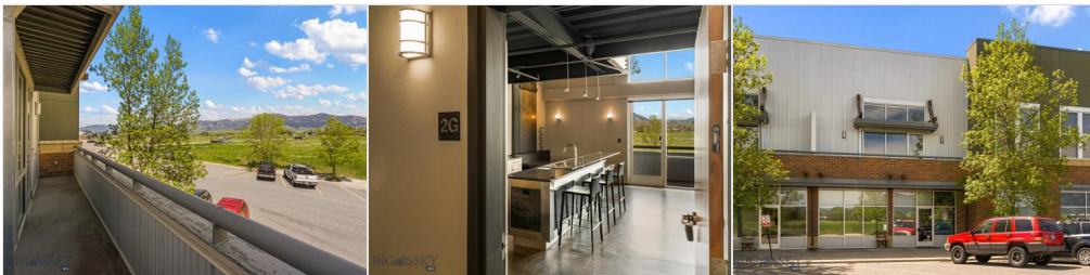
Main level view to balcony