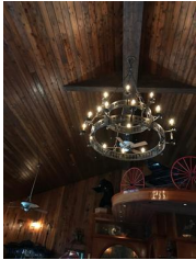
The handcrafted steel chandelier in the Great Room of the Lodge.