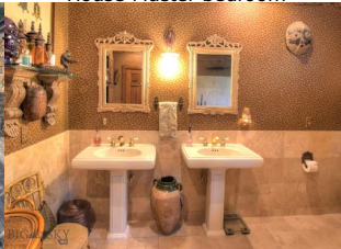
The Master Bathroom with two sinks