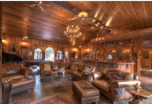
Shadowwood Lodge: Great Room with Cherry Bar.