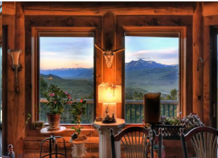
House Deck overlooking the grounds and the Paradise Valley