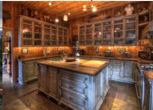
Shadowwood Lodge: The Kitchen, paneled in Pecky Cyprus.