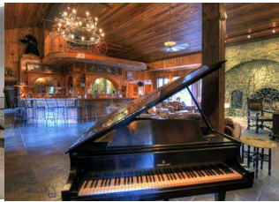
Shadowwood Lodge Great Room