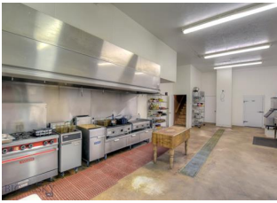
Shadowwood Lodge, Commercial Kitchen