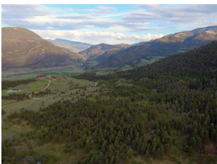
View of the Yellowstone River and Yankee Jim Canyon.