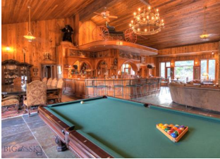
Shadowwood Lodge: Great Room with Cherry Bar.