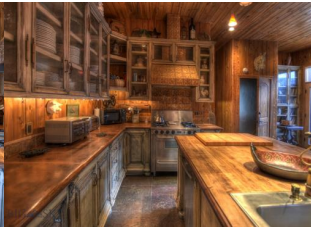
Shadowwood Lodge: Kitchen on second floor with custom cabinets.