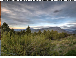
View of the Paradise Valley.