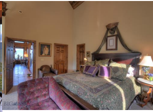
House Master bedroom