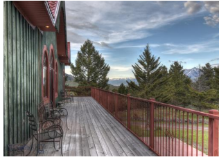
Deck at the Lodge with solid Cyprus decking.