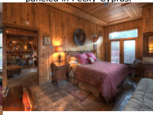
Shadowwood Lodge: one of 3 Bedrooms on second floor.