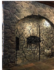
Hand Wrought Iron Doors for large stone fireplace