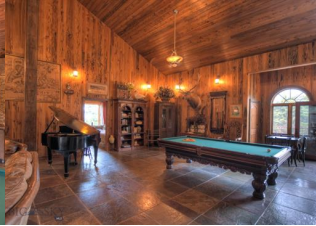
Shadowwood Lodge Great Room with Cyprus paneling